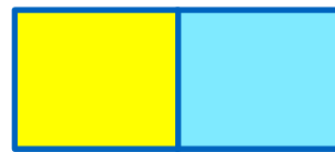
Table 3 Offshore Seascape, Landscape and Visual Amenity