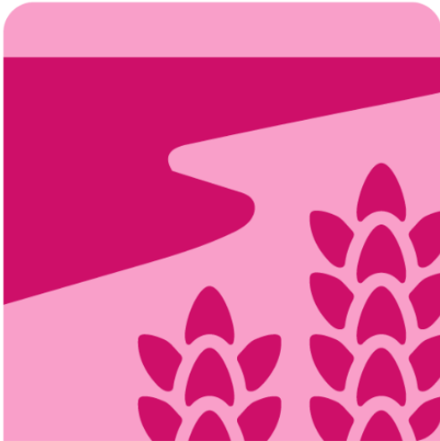
Suffolk & Essex Coast & Heaths National Landscape