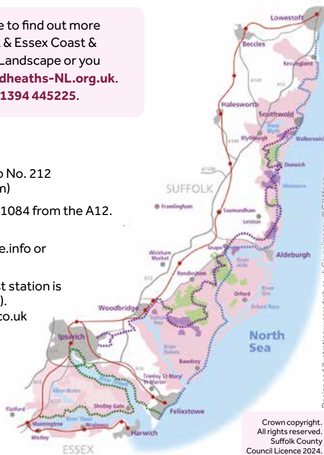
Design and illustration: wearedrab.co.uk